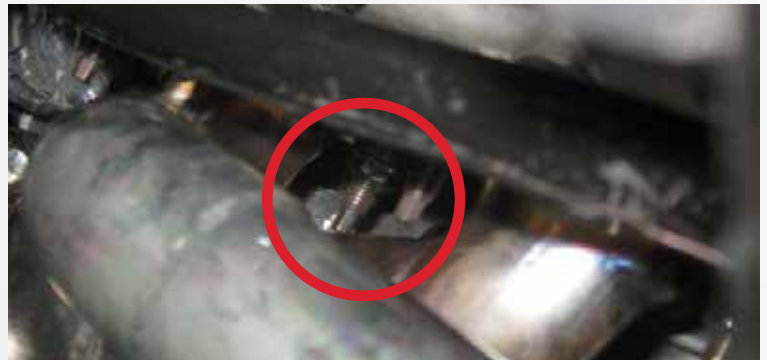
For both the driver side and passenger side place the supplied BBK Gasket and header into place. Then Tighten.

NOTE! The passenger side is a little more tricky. Make sure to leave all the nuts loose so the header has room to move. With the stock x-pipe hanging out of the way, the bottom rear nut needs to be tightened from behind the collector.