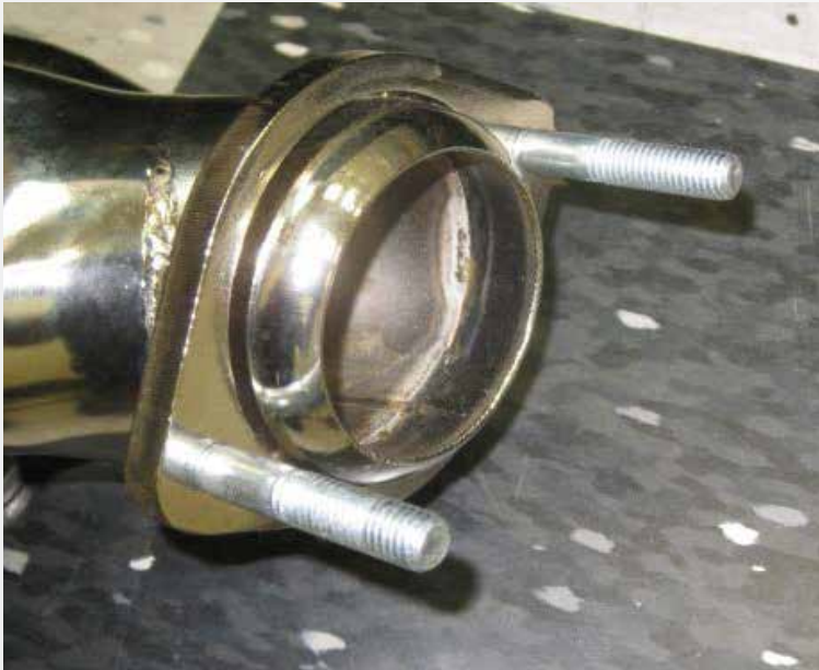
Install the supplied studs onto the BBK Header Collectors.