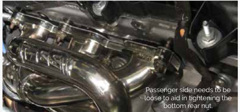
Passenger side needs to be loose to aid in tightening the bottom rear nut.