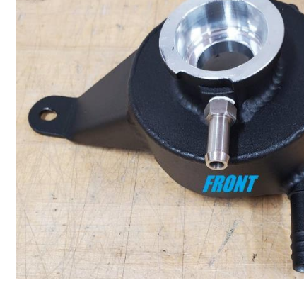
Figure 6 (PG Coolant Reservoir)

Connect the coolant lines to the Petty's Garage intercooler reservoir in the same location as the factory reservoir. Transfer the overflow hose to the new reservoir, then position over the strut tower.