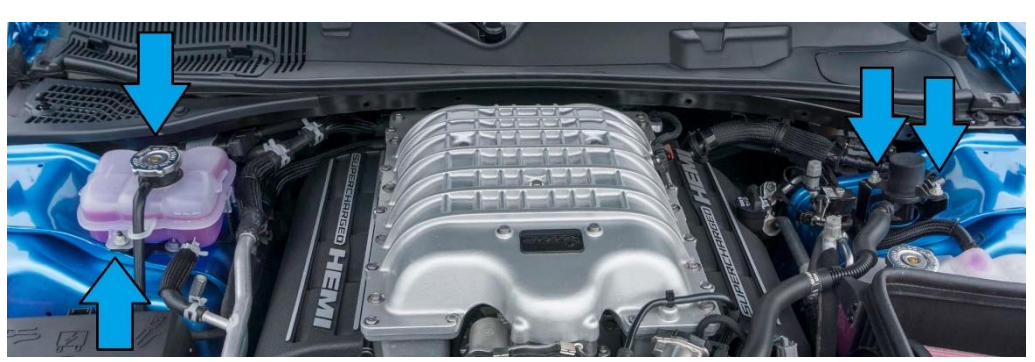
Figure 2 (10MM Nuts)