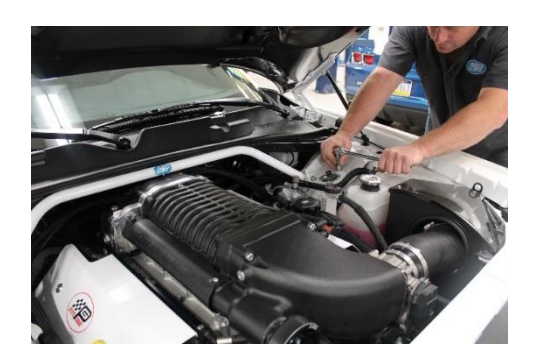
Figure 8 (PG-STB-005 Shown)

Note: This reservoir and connected cooling system is not integrated into the primary engine coolant system. The reservoir serves primarily as a fill point, having little pressure.